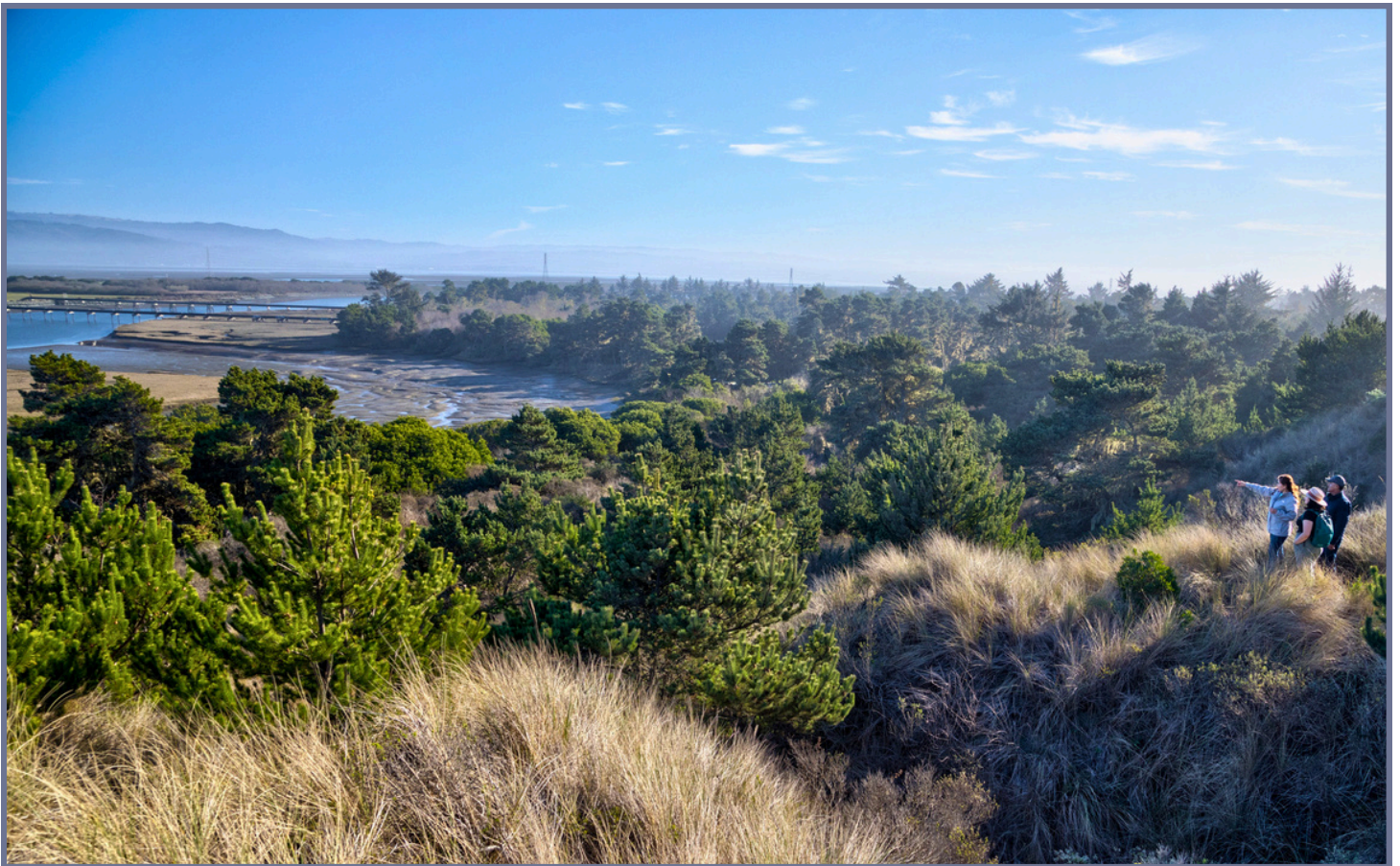
Visitors enjoying the view at the Ma-le'l Dunes Unit of the Humboldt Bay National Wildlife Refuge.

Nature is for everyone. This is a core belief of our organization that guides so much of our work. For over 40 years, we have been providing free and accessible education programs to engage people of all ages in exploring, learning about, and stewarding Humboldt County's unique and ecologically diverse coastal dune environments. Our free interpretive facility, the Humboldt Coastal Nature Center, serves as a gateway to the dunes and helps us engage visitors of all backgrounds and abilities in connecting with nature. When I first started working with Friends of the Dunes in 2008, we had recently purchased the "Stamps Dune House" and adjacent land, and the Nature Center itself was just a dream. It was an exciting time for the organization, and I was inspired to see the transformation of this unique earth shelter house into a welcoming interpretive facility and hub for accessible nature education programs. The goal has always been to improve coastal access for our community, rooted in the core belief that nature is for everyone.