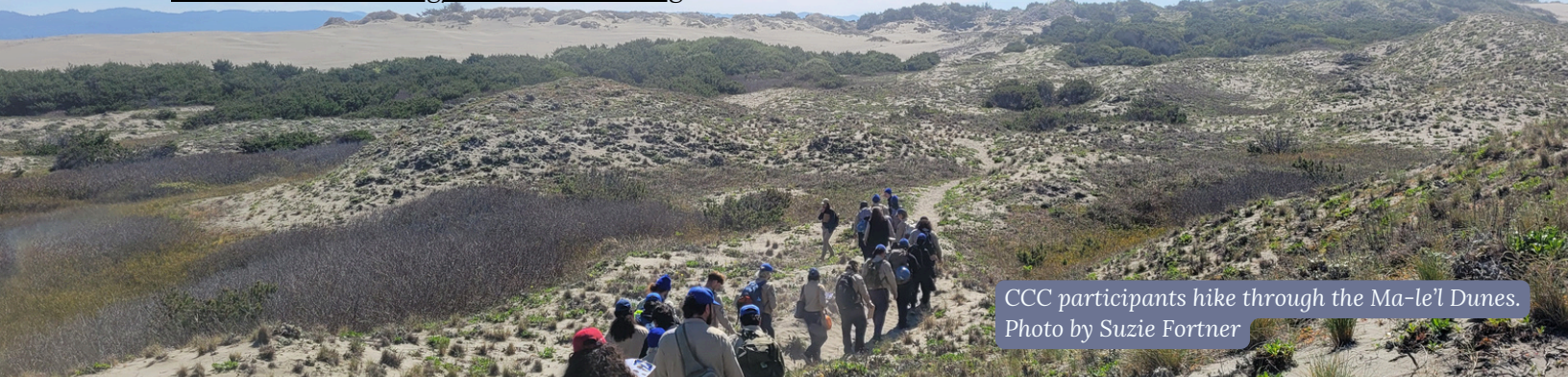
CCC participants hike through the Ma-le'l Dunes.

UC Environmental Stewards University of California Agriculture & Natural Resources