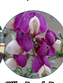
Silky Beach Pea