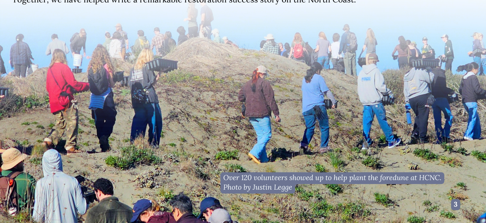
Over 120 volunteers showed up to help plant the foredune at HCNC.

Together, we have helped write a remarkable restoration success story on the North Coast.