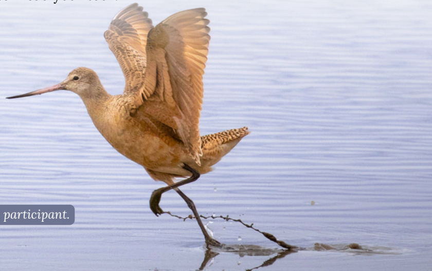
Marbled Godwit photo taken by a CCC Coastal Naturalist participant. Photo by Aiden Bartels

While eBird is easy to use and learn on one's own, a great way to learn to use the program is to go birding with a group of birders and keep track of sightings together – common practice, for example, at Godwit Days , our annual Arcata-based birding festival held each April, and weekly Redwood Region Audubon Society -led tours of the Arcata Marsh and Wildlife Sanctuary. You may even be lucky enough to have Ken Burton lead your tour.