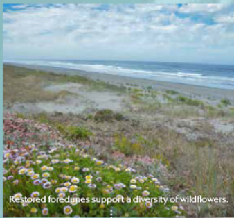
Restored foredunes support a diversity of wildflowers.