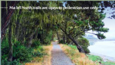
Ma-le'l North trails are open to pedestrian use only.

Humboldt Bay National Wildlife Refuge U.S. Fish & Wildlife Service