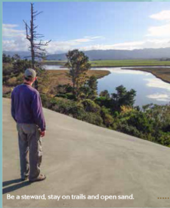
Be a steward, stay on trails and open sand.

Lanphere Dunes Unit BY PERMIT ONLY Humboldt Bay National Wildlife Refuge