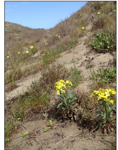
Humboldt Bay wallflower on the new property

Looking back over the year there were numerous highlights. On the land stewardship front, we added 2.8 acres of land to the Nature Center property, strengthened connections with local land trusts through the Durable Collaborations project, and worked with our partners to develop a Dune Restoration FAQ sheet that references research and literature related to coastal restoration. Through our education and outreach programs we teamed up with our neighbors at Redwood Coast Montessori school to create a native plant garden and a program to foster young coastal stewards, collaborated with HSU and the Humboldt Office of Education to create a Quest at the Nature Center and with support from the State Coastal Conservancy, we extended Nature Center Hours, expanded family events and improved our outreach displays. Our new Business Program has helped local business showcase their support for coastal conservation and the Gear Sale, Sand Sculpture Festival and Wine by the Sea events not only raise funds to support our programs, but also help connect the community to the coast.