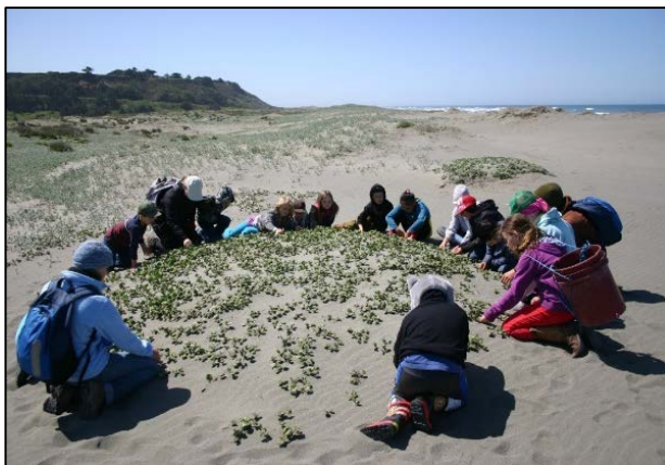
Bay to Dunes South field trip

In 2014, Friends of the Dunes offered 7 field trip programs: Bay to Dunes North, Bay to Dunes South, Adopt a Dune, Future Conservationists, Cows & Cattails (in collaboration with North Coast Regional Land Trust), and Ocean Day. In addition, we coordinated the guided walks for school groups during the California Native Plant Society's Wildflower Show. In total, these programs served 2,881 students from 37 schools. Through funding from grants, private donors, and fundraisers, we were able to waive $5,132 in program fees, and provide schools with $11,800 in bus scholarships. A total of 55 volunteers contribute 993 hours to these programs. 7 of these volunteers were interns receiving college credit or a per diem reimbursement.